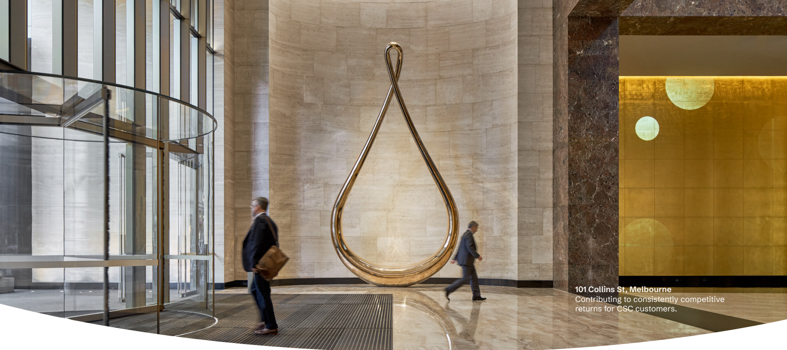
101 Collins St, Melbourne Contributing to consistently competitive returns for CSC customers.